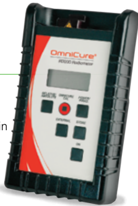
Optional Accessory: OmniCure R2000 Radiometer

Radiometry is an essential link for measuring the light output from a UV curing system in order to maintain a repeatable process. The OmniCure R2000 UV Radiometer can be combined with the OmniCure S1500 UV curing system to provide a complete curing station with unmatched control and repeatability.