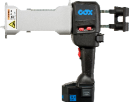
POWERPUSH 7000 MP