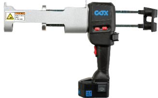
POWERPUSH 7000 MR