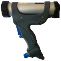
ULTRAFLOW [ 3 models ]