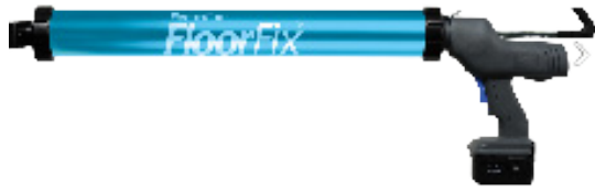
JETFLOW [ 2 models ]