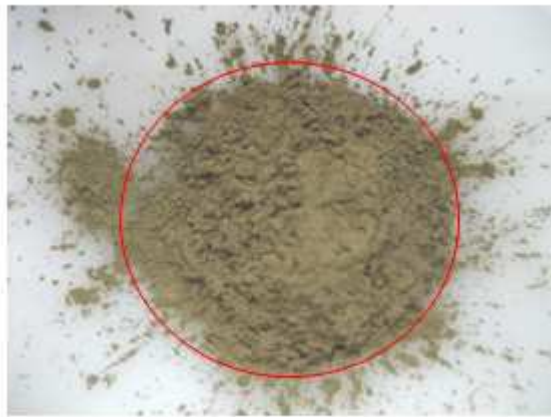
Before mix; Au Ball in red circle on sealant